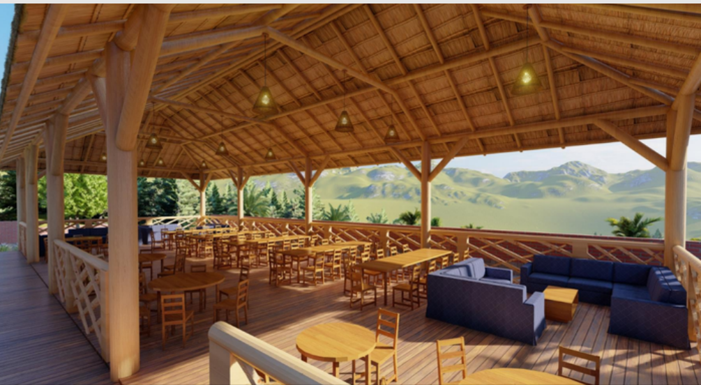
DINING AREA FROM KITCHEN CORNER